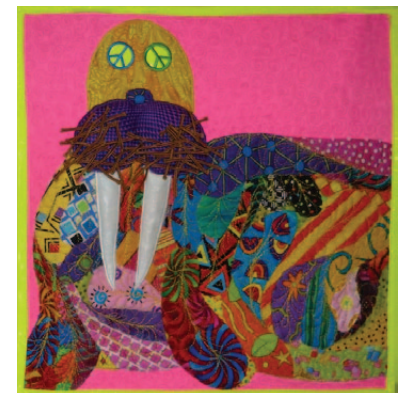
I am the Walrus, Marty Ornish

The Beatles were immortalized in art quilts when members of Canyon Quilters Guild of San Diego created 14" square quilts (slightly larger than an album cover) inspired by a Beatles song, album or movie. From "All You Need is Love" to "Sgt. Pepper's Lonely Hearts Club Band" familiar tunes will pop into your head when you view these 43 vibrant quilts that collectively capture the mood of an era.