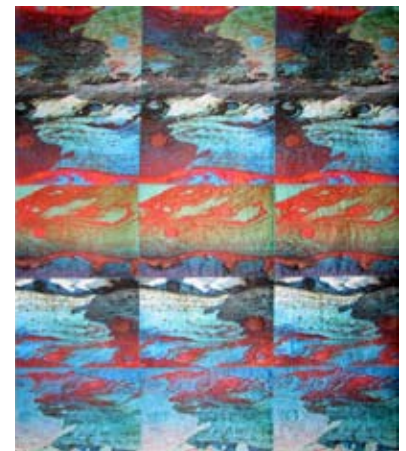
Above: “Moon and Mars: Sand Pictures #3” by Charlotte Ziebarth

Please call the Gallery at 619-546-4872 to RSVP for the Opening Reception—$8, the Juror's Walk Through—$20, and the SAQA Panel Discussion—$20. Admission to the Quilt Visions 2008 show is FREE for all Quilt Visions, Oceanside Museum of Art, and SAQA members. Your credit card payment will secure reservations.