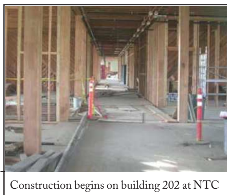
Construction begins on building 202 at NTC

We are at the 11th hour. We must all work together to make the Community Build a Success. WE NEED YOU! - Bob Leathers: