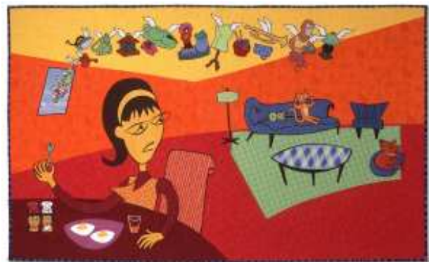
Mysterious Migration of Miscellaneous Objects by Pam RuBert

To be held at NTC Promenade, Bldg 200 from 9-4, box lunch included