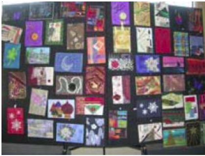
Christmas on the Promenade